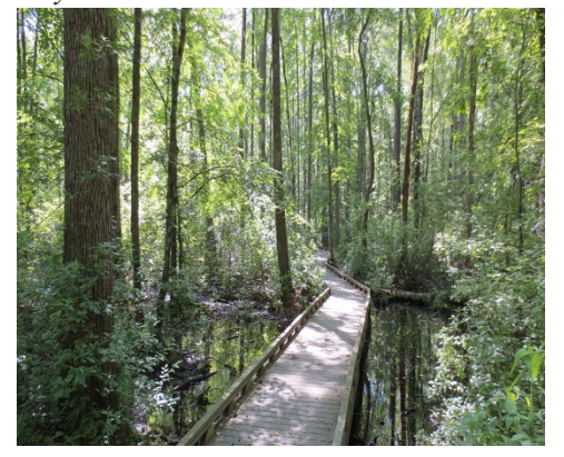
Great Swamp NJ

Over the decades, people walking or driving near the Great Swamp, have claimed to see a Headless Hessian, Big Foot, and the ever-popular Swamp Devil. A dinosaur mammoth skeleton was discovered in 1908 in the Swamp.