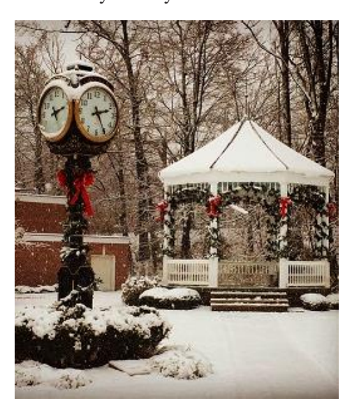
Photo: Centennial Clock and Gazebo in downtown Chatham Borough decorated for the Holidays

In lieu of the celebration, the society has created a holiday keepsake for your tree. Please keep an eye out for the holiday greeting to arrive in your mailboxes. We wish you a happy, safe and healthy holiday season!